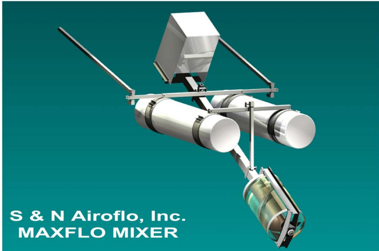
S & N Airoflo, Inc. MAXFLO MIXER

Save energy by applying S&N Airoflo's low speed, low HP mixers, with high pumping rates and directional flow.